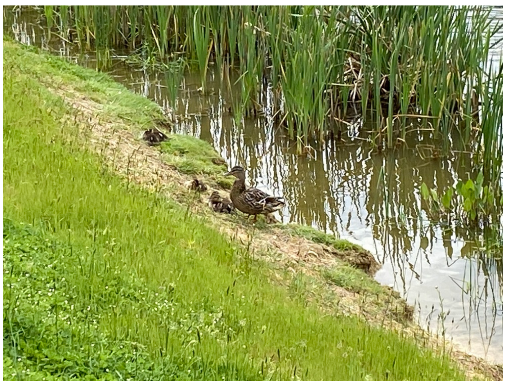
Protective Mama for sleeping baby ducklings

Stillwaters Estates is a great walking neighborhood. A fairly flat neighborhood, with a few hills that can be taken by choice. A lot of sidewalks, but sidewalk walking is rare.