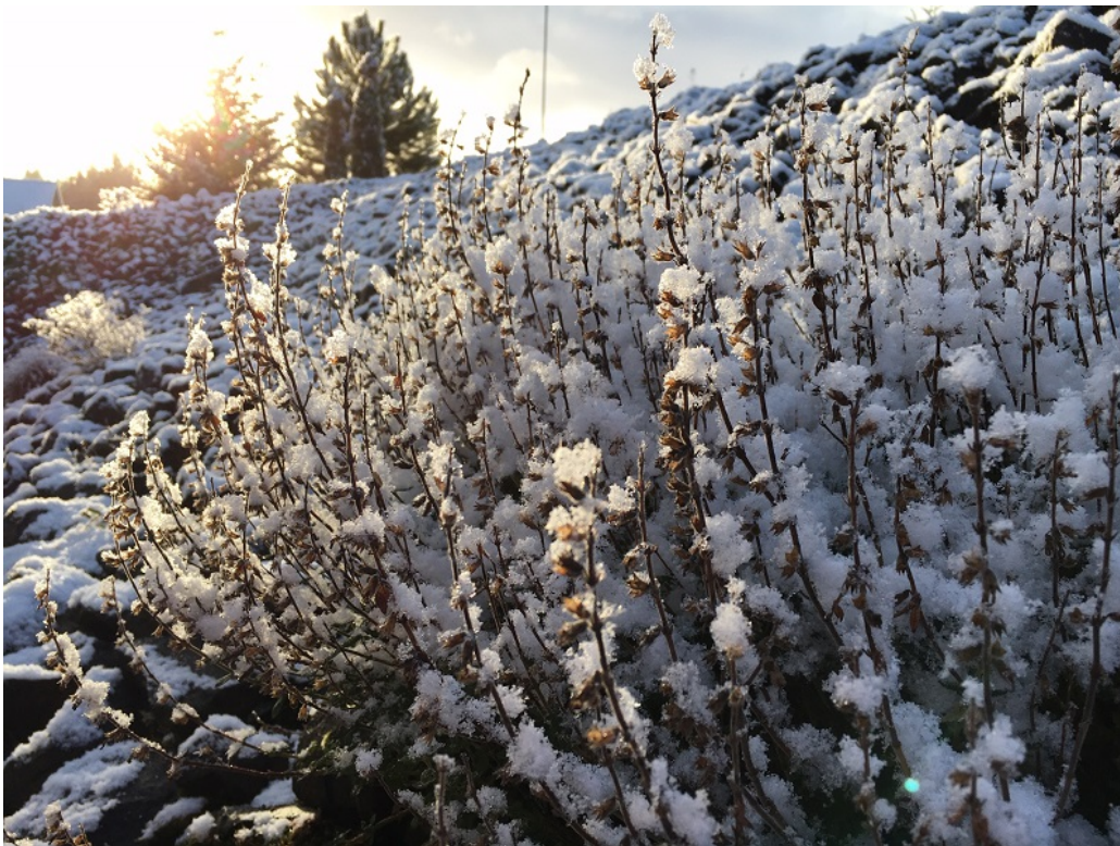
Morning Sun on the Snow

This month has been full of interesting weather. Earlier this month we had lovely snow. This was the view in my backyard one morning. It was the perfect kind of snow. It stayed long enough to be admired but not too long so as to be annoying!