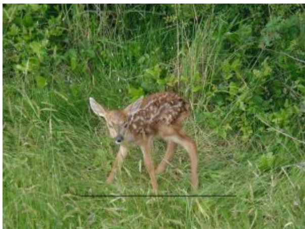
Early yet but soon we will see these wee ones